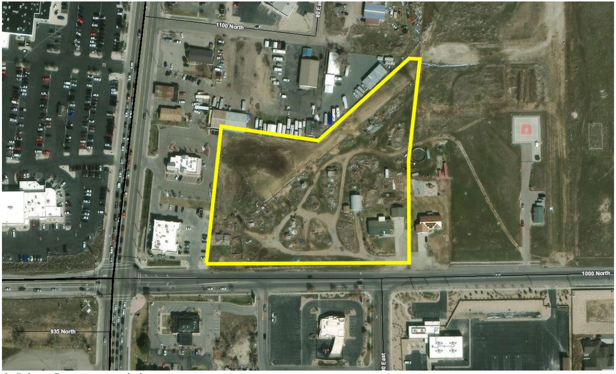
1: Subject Property: aerial photo