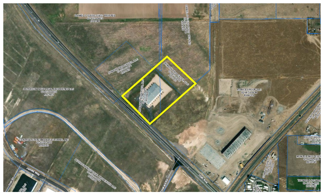
1: Subject Property, aerial view