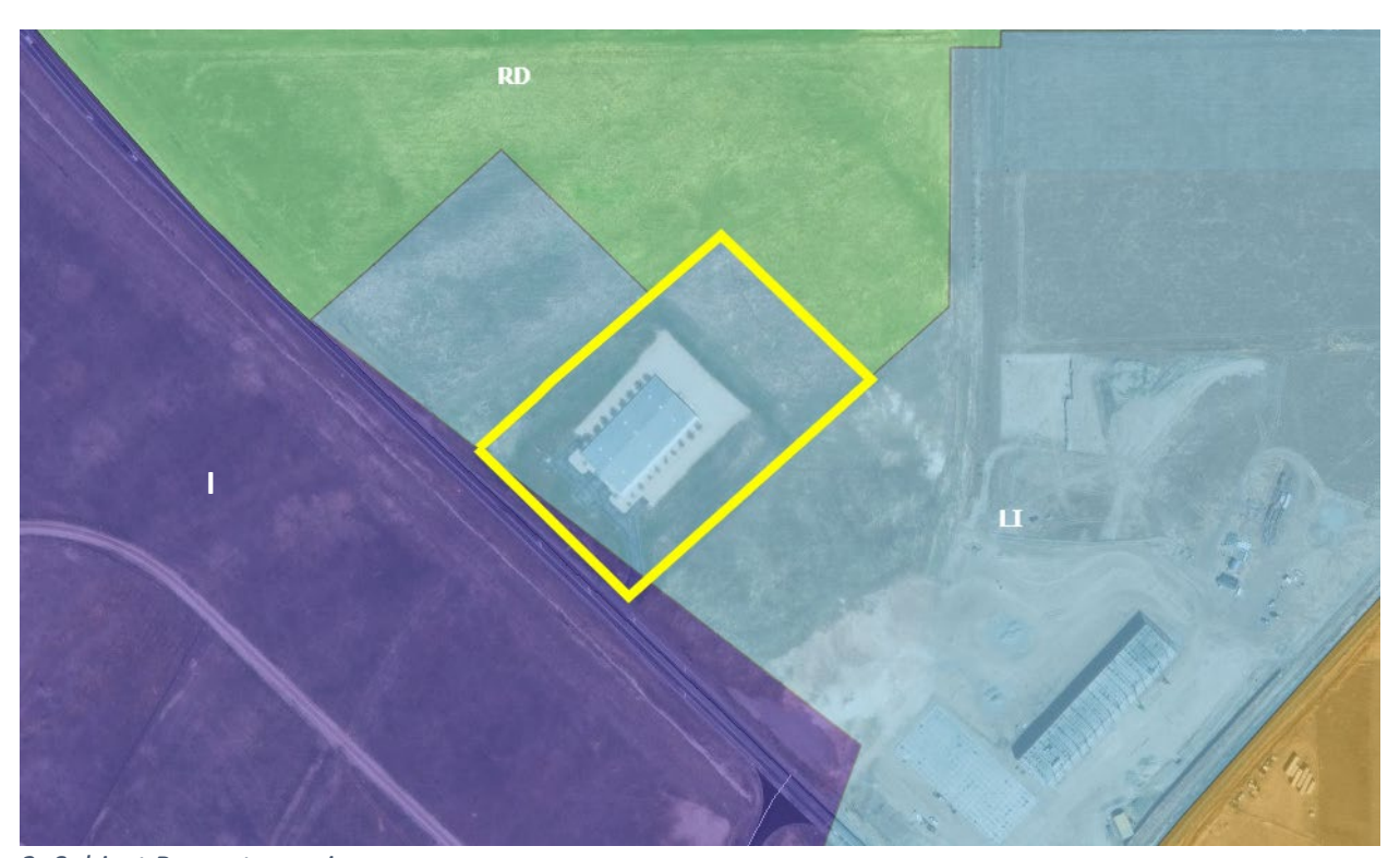
2: Subject Property, zoning